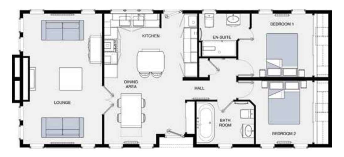
45' x 20' (13.716m x 6.012m) 2 bedrooms, 1 bathroom and en-suite

The Ikon is available in an impressive 50' x 20' floor plan, as shown below, although we can modify the floor plan to suit your individual requirements. Please contact our sales team for more details.